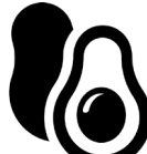
A medium avocado