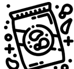
One small bag of potato chips