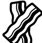
4 ounces of steak or 6 strips of bacon