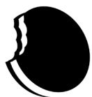
One large bagel or six Oreo cookies

Foods that contain about 300 calories include the following: