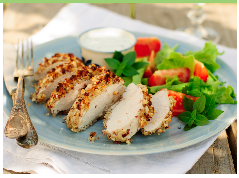
Adapted from <u>food.com</u> and <u>food52.com</u>.